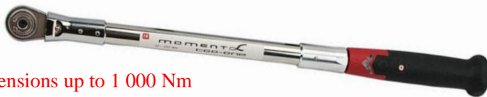
Extensions up to 1 000 Nm

One Too has recently developed a mechanical click extension, which provides a distinctive “Click” when reaching the pre-set torque value.